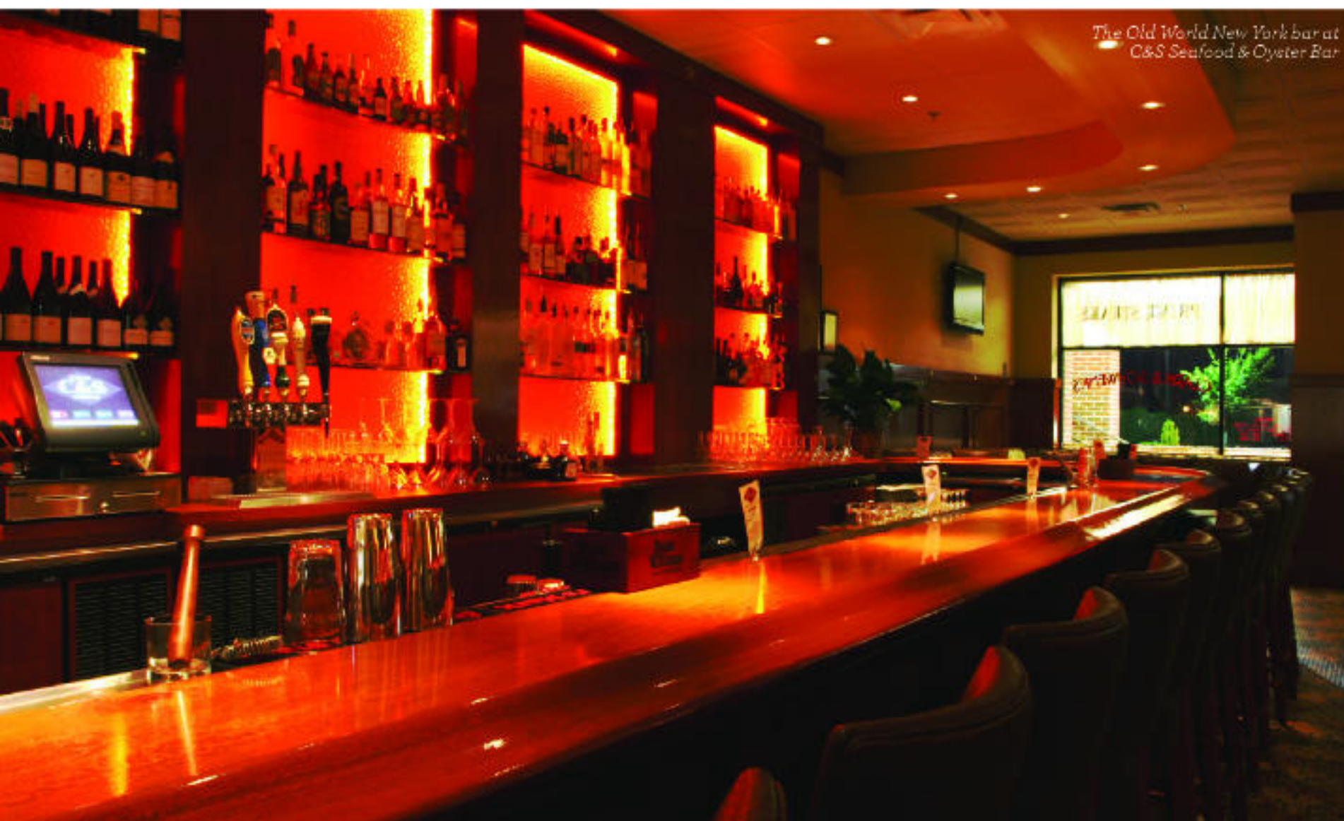
The Old World New York bar at C&S Seafood & Oyster Bar