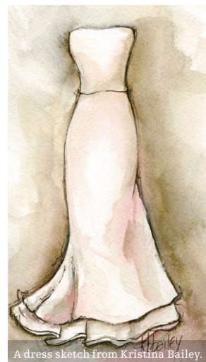
A dress sketch from Kristina Bailey.

After months of searching, you found the perfect dress. So what's a bride to do after the big day? For a modern twist on the traditional dress portrait, watercolor sketches and avant-garde photographs will preserve your fashion statement with a work of art that goes beyond the photo album.